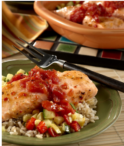
Simple Salmon Supper

To help you reach or stay at a healthy weight and reduce health risks, it's important to know how many daily calories are right for you. The idea is to enjoy foods that provide important nutrients, such as protein, fiber, vitamins and minerals, without overdoing on the calories you need for energy.