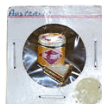
VEGEMITE PIN 1980s