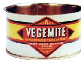
FLAT TIN 1937