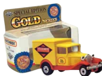
SPECIAL EDITION MODEL 'A' FORD VEGEMITE TRUCK 1993