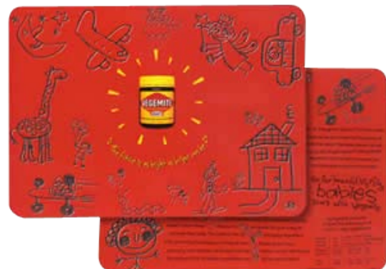
VEGEMITE PLACE MAT 2000