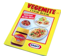
VEGEMITE COOK BOOK 1992