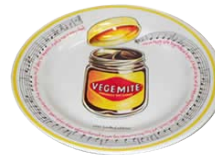
"HAPPY LITTLE VEGEMITE'S" PLATE 1995