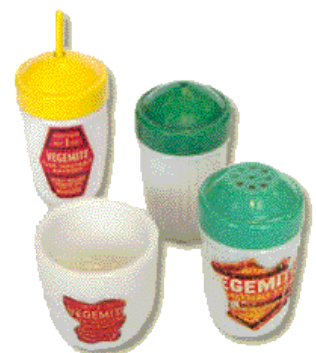
MUSTARD POT / EGG CUP / SALT & PEPPER SHAKERS 1970s