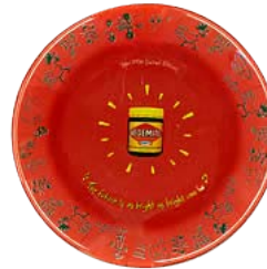
LIMITED EDITION PLATE 2000