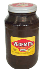
BIGGEST JAR OF VEGEMITE EVER MADE (3.5KG) 1988