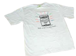
ROSE ON EVERY CHEEK T-SHIRT 1980s