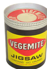
VEGEMITE JIGSAW 1983