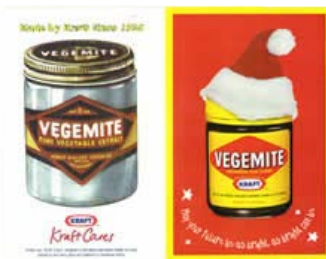
VEGEMITE CHRISTMAS CARD 1990s