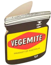
VEGEMITE CARD 1990s