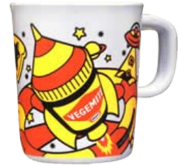
LIMITED EDITION MUG 2000