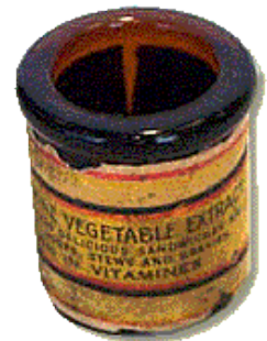
SHOWBAG SAMPLE 1933