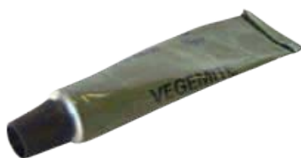
AUSTRALIAN ARMY TUBE OF VEGEMITE 1990s