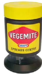
PORTION CONTROL DISPENSER 1990s