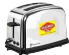
VEGEMITE TOASTERS 1999