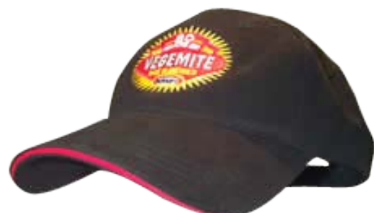
80 YEARS OF VEGEMITE CAP 2003