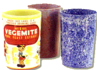
DISNEY BAKELITE BEAKERS 1940s