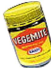
VEGEMITE PIN 2000