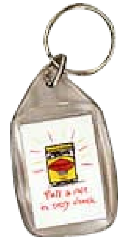
KEY RING 2000