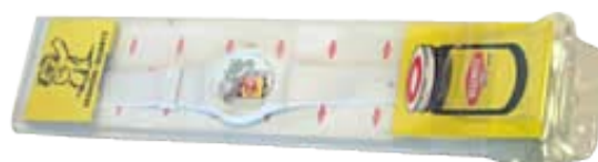
VEGEMITE WATCH 1980s