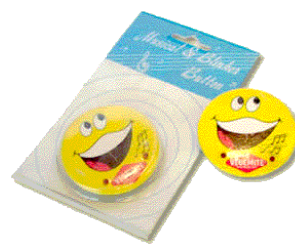
MUSICAL & BLINKER BUTTON 1970s