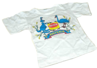
AUSTRALIA & VEGEMITE T-SHIRT 1980s