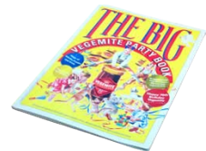
THE BIG VEGEMITE PARTY BOOK 1992