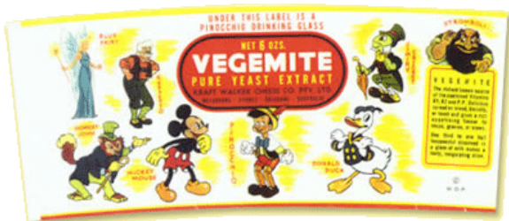
DISNEY LABEL 1949