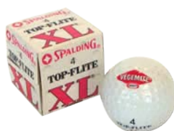
VEGEMITE GOLF BALL 1990s