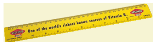
VEGEMITE RULER 1990s