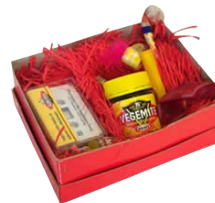
VEGEMITE 75TH BIRTHDAY PRIZE PACK WITH A COMMEMORATIVE JAR AND HAPPY LITTLE VEGEMITE SONG ON TAPE 1997