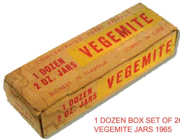
1 DOZEN BOX SET OF 2OZ. VEGEMITE JARS 1965